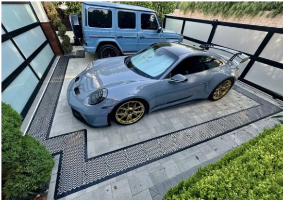
Single Row of Tiles