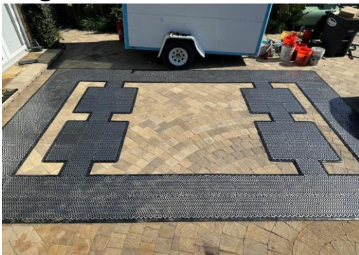
Double Row w/Tire Pads